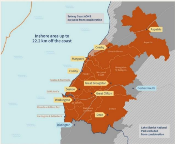
Illustrative map of the search area identified by the Allerdale GDF Working Group