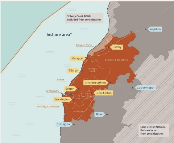
Illustrative map of the search area being considered to host a GDF identified by the Allerdale GDF Working Group

From 1 st April 2023, it will incorporate the electoral wards of Dearham & Broughton; Harrington; Maryport North; Maryport South; Moss Bay & Moorclose; Seaton; St Johns & Great Clifton and St Michaels